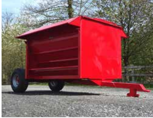
CCF0012 Mobile Bull Beef Feeder

1250kg/1500kg. Double sided calf creep bulk feeder, for larger groups of animals, like the single sided feeder creep gates can be removed to allow ad-lib feeding, also has height adjustable legs. 8ft and 10ft models available.