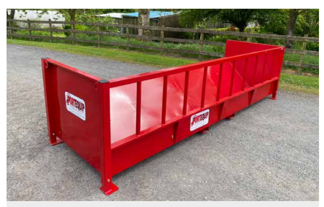
Bunker Feeder 4.5 Metre

Standard sizes 3000mm (10ft) and 4570mm (15ft). Custom built sizes from 1800mm (4ft) to 6000mm (20ft). Tombstone front bars available upon request