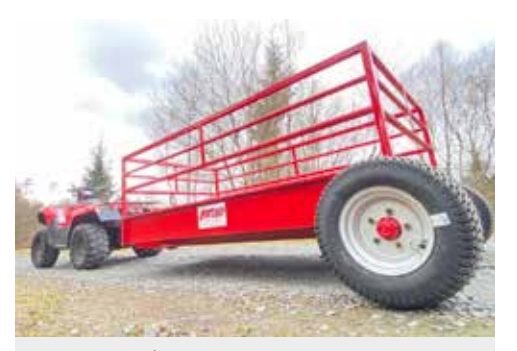
S801 Horizontal Bar

S201/1 20' x 4'6" 56 Space (20ft trailer fitted with 10.5/75 x 15.3)