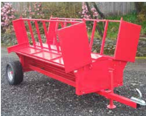
Mobile lamb creep feeder with creep gates in transport position.

600kg mobile lamb creep feeder towed by ATV. Creep gates fold down to form lamb creep.