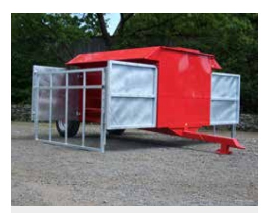
CCF012 Mobile Calf Creep