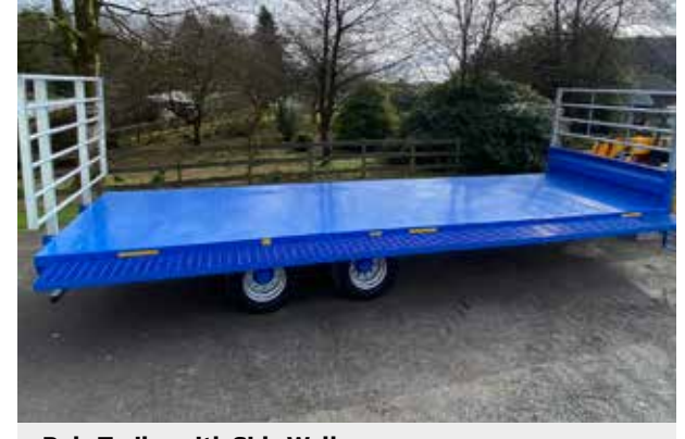
Bale Trailer with Side Walkway

A compact bale grab that can lift 2 to 3 bales safely.