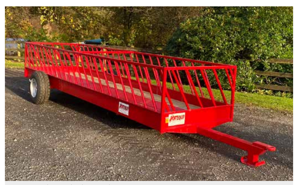
S201 4'6" x 20' Sheep Feed Trailer Diagonal Bars