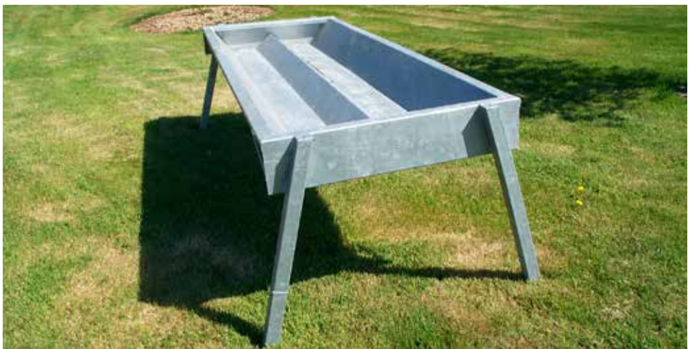
CF052 Double Cattle Trough CF052 With Wheels

Double cattle trough for feeding in the field or inside. Heavy duty, all welded construction. One piece folded trough for strength. Fully galvanized after manufacture. As shown with wheel option.