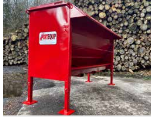
CF049/8 Single Sided CF049/10 Single Sided

500kg single sided bull beef feeder. Complete with lid and rain canopy. Adjustable height legs.