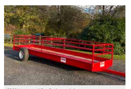
S201 Horizontal Bar for horned sheep