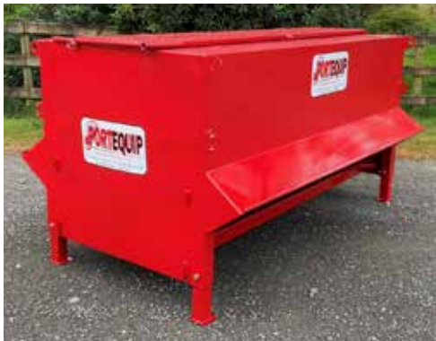
SFS018/2 8' 1250kg Hogg Hopper

Both with Internal adjustable sliders to control flow rate of feed. Adjustable leg height for easy feeding.